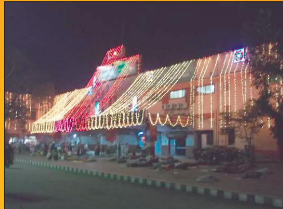
Enhanced circulating area at Dhanbad Station