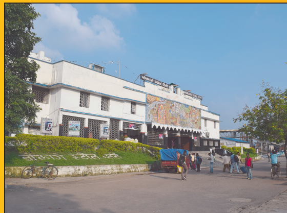
Enhanced Platform surface at Bokaro Steel City Station