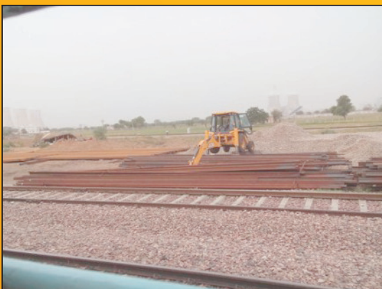
Construction of new line in progress