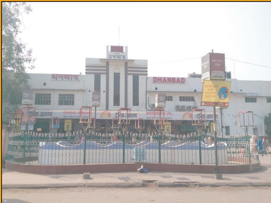
Enhanced circulating area at Dhanbad Station