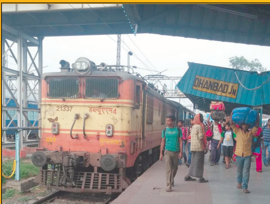
Enhanced Foot Over Bridge at Dhanbad station