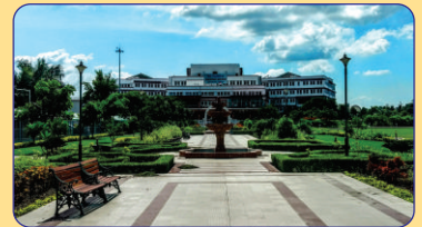
East Central Railway, Hajipur